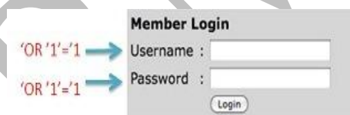
Figure 2 tautology based SQL injection.

SELECT accounts FROM users WHERE login='' or 1=1-AND pass='' AND pin= The code injected in the conditional (OR 1=1) transforms the entire WHERE clause into a tautology. The database uses the conditional as the basis for evaluating each row and deciding which ones to return to the application. Because the conditional is a tautology, the query evaluates to true for each row in the table and returns all of them.